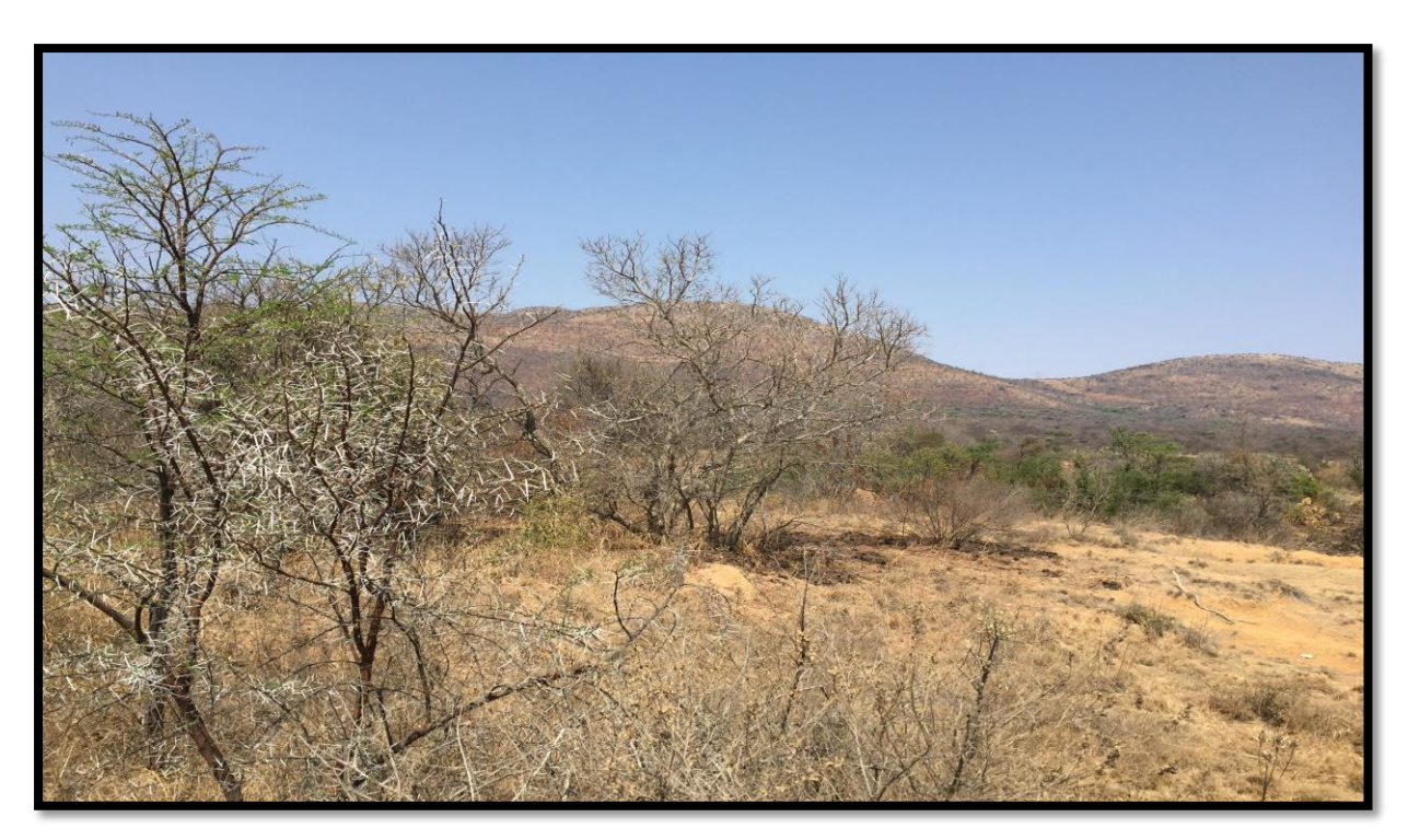
Figure 4 : View of some of the areas that forms part of the third corridor.