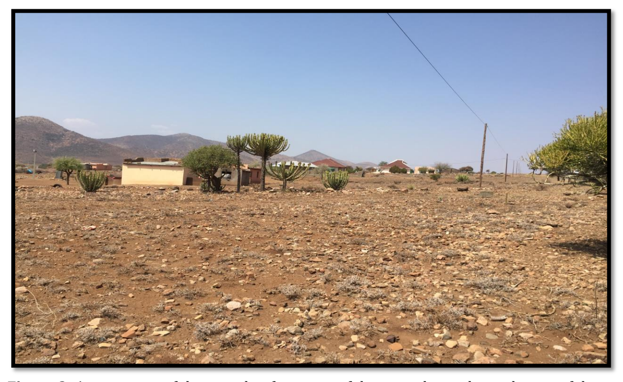
Figure 3: An overview of the area that form part of the second corridor and some of the houses that will be affected.